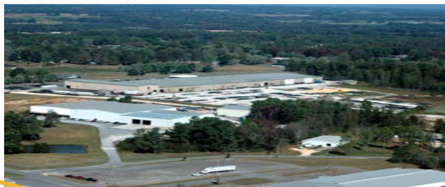
BlueScope North America